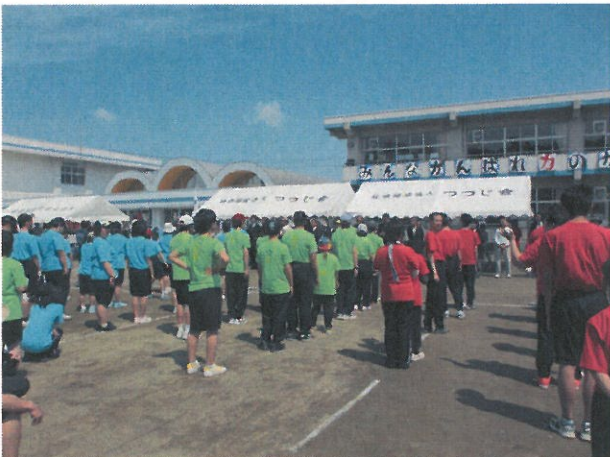
Opening ceremony went well because of the great weather!! But do not forget to drink waters.