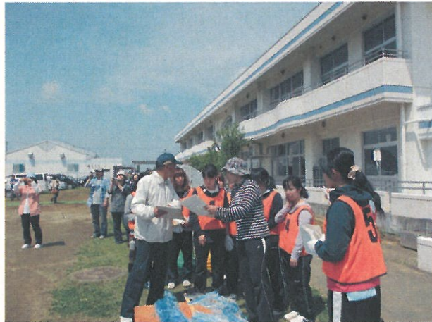
Instruction about today' s program from teachers and vice principle. Some of the students will be back in fall to support a school festival which handicapped students give a presentation about what they' ve learned.